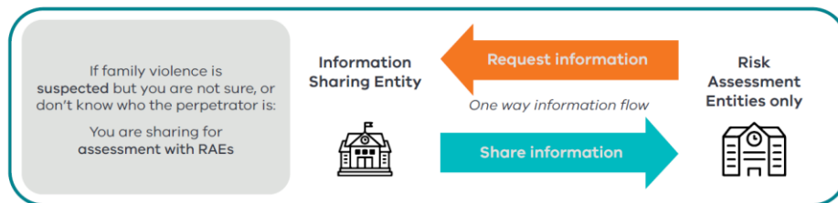
Figure 1: Overview of activities when sharing information for risk assessment

Family violence risk assessment is an ongoing process and is required at different points in time from different service perspectives. Education and care services will have a role in working collaboratively with other services to contribute to ongoing risk assessment and management of family violence.